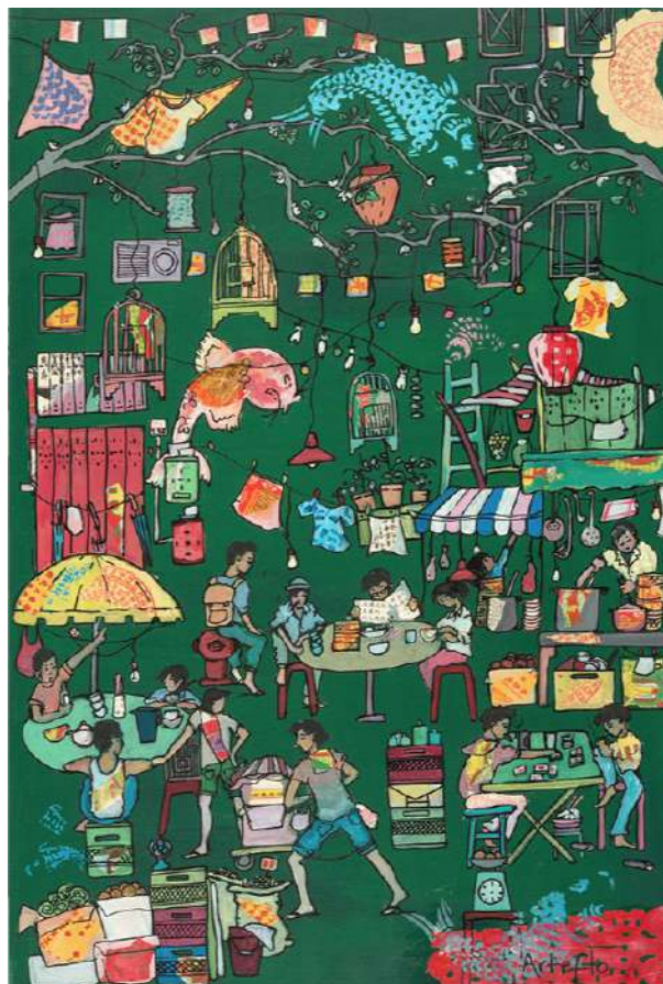
Around Lunch Time 2017 | Mixed | 60x90cm