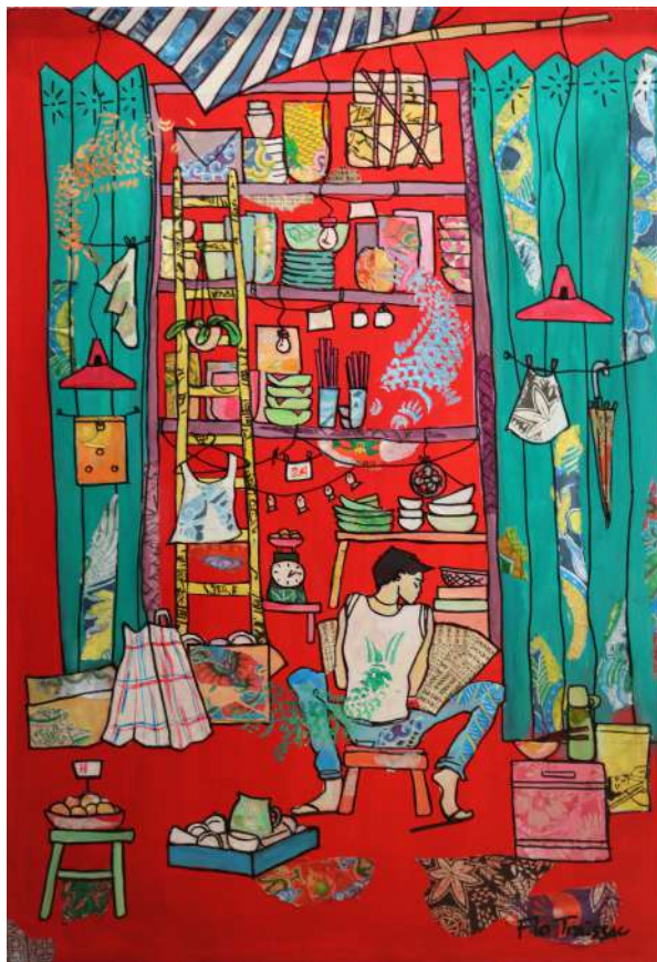
Hong Kong I 2019 | Mixed | 61x91cm