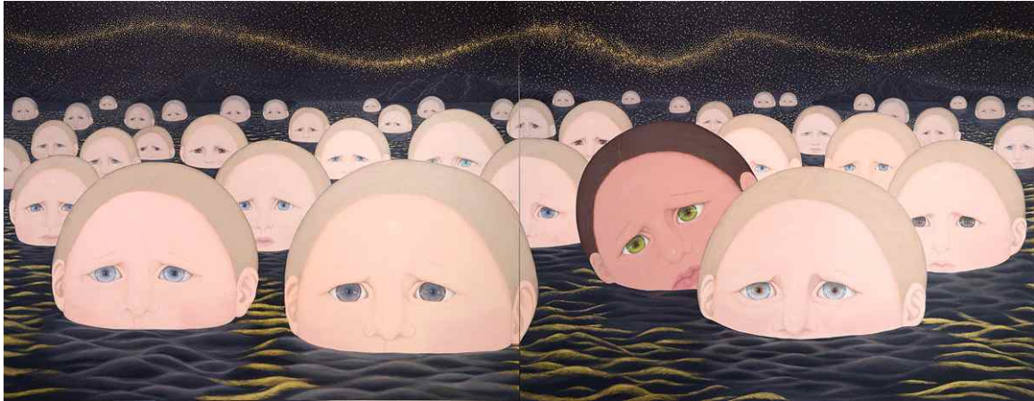
Am I only stranger here 233.6x91cm. Acrylic on canvas. 2018