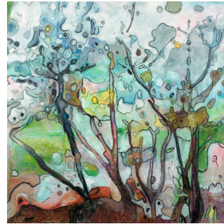
C-dur (Musical Collection), 2016 Size: 100x100 cm Medium: watercolor/ pastel on woodboard