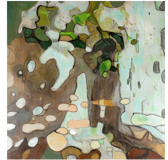
Thaw, D-dur (Musical Collection), 2017 Size: 100x100 cm Medium: watercolor/ pastel on woodboard