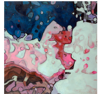
Es-dur (Musical Collection), 2017 Size: 100x100 cm Medium: watercolor/ pastel on woodboard