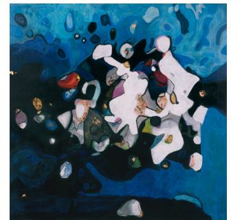
F-dur (Musical Collection), 2016 Size: 100x100 cm Medium: watercolor/ pastel on woodboard